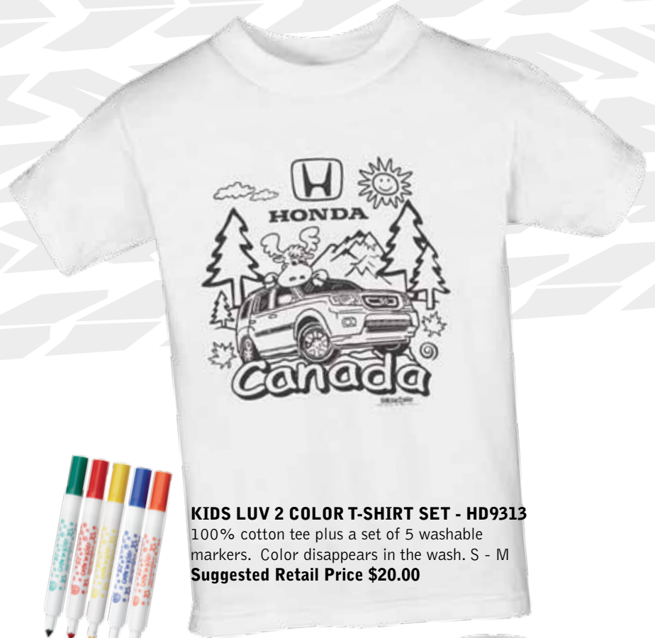
KIDS LUV 2 COLOR T-SHIRT SET - HD9313 100% cotton tee plus a set of 5 washable markers. Color disappears in the wash. S - M Suggested Retail Price $20.00