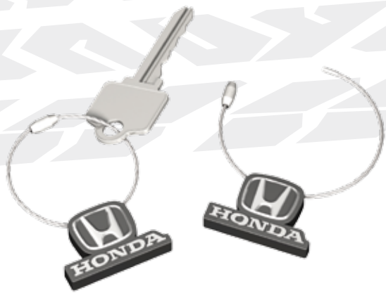
HONDA ROPE KEYCHAIN - HD00600 Custom Honda design keychain. Available only while quantities last. Suggested Retail Price $7.00