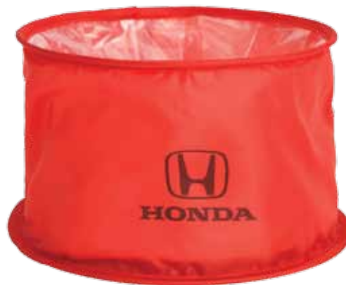
FOLD-N-GO PET BOWL - HD92740 Great for walks, camping or day trips. Measures 8" x 5.25" when open. Honda logo screened on side of bowl. Suggested Retail Price $11.00