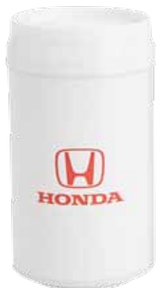
CAR CAN - HD93140 Holds 55 wet tissues and is designed to fit into a cup holder of any vehicle. Honda logo imprinted on front centre. Suggested Retail Price $4.00