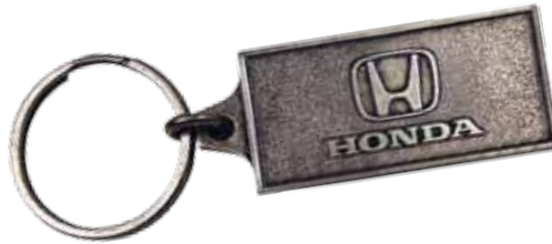
METALLIC KEY FOB - HD00580 Honda logo laser engraved on front. Suggested Retail Price $3.00