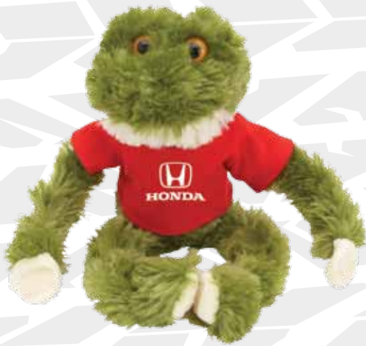
12" HUGGABLE PLUSH FROG - HD00710 Honda logo screened on front of t-shirt. Suggested Retail Price $14.00