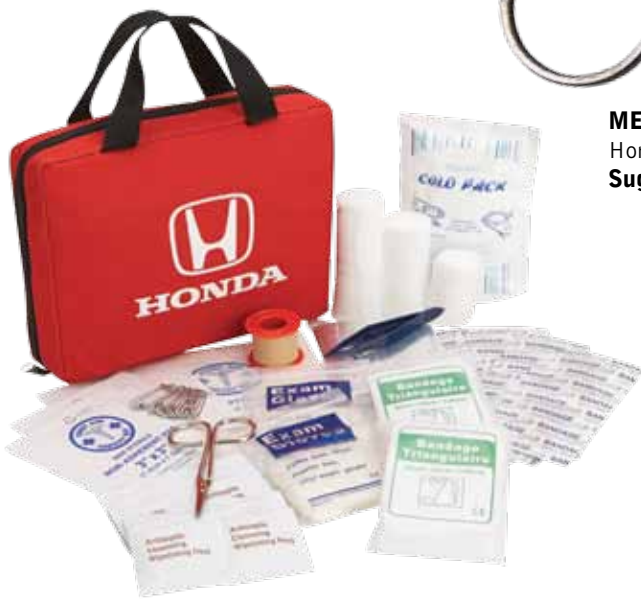
SAFETY FIRST FIRST AID KIT - HD92820 Zippered nylon case contains: triangular bandages, instant cold pack, first aid tape, wound dressing, disposable vinyl gloves, conforming bandage, plastic tweezers, scissors, sterile eye pad, adhesive plastic bandages, knuckle fabric bandages, fingertip fabric bandage, antiseptic wipes, safety pins, emergency blanket and a non-adherent pad. Honda logo screened on front of pouch. Suggested Retail Price $27.00