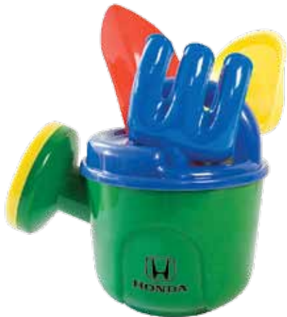
TOY GARDENING KIT - HD92770 Packaged in a fishnet bag. 3.75"W x 3.75"H x 5.5"D. Honda logo screened on front of watering can. Suggested Retail Price $9.00