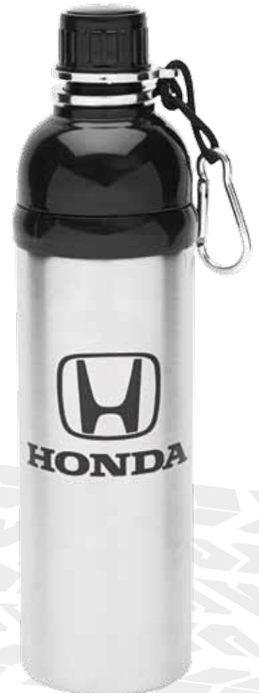
PET WATER BOTTLE - HD92750 24 oz. stainless steel construction and BPA free. Wide mouth for adding ice cubes & easy cleaning with 2 leak resistant caps. Carabiner included. Honda logo screened on front. Suggested Retail Price $12.00