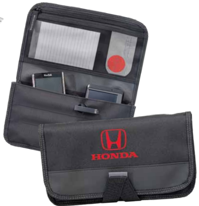
ROADSIDE COMPANION KIT - HD92710 Kit includes tire pressure gauge, aluminum flashlight (incl. AAA battery), pen and 3" x 5" paper pad. Interior features removable Velcro divider and clear ID window. 9.5"L x 4.5"H x 1.5"W. Honda logo screened on front. Suggested Retail Price $23.00