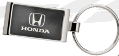
METALLIC KEY RING - HD93170 Honda logo laser engraved on front. Suggested Retail Price $5.00