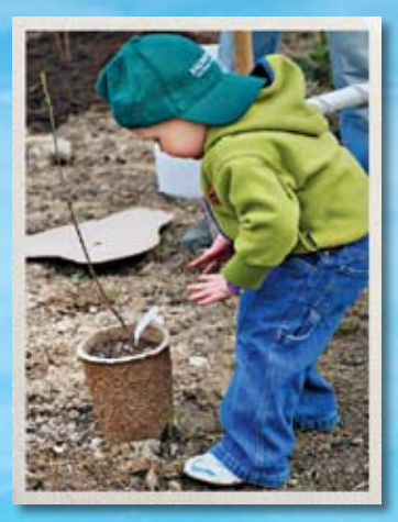
Honda associates and families have helped plant more than 71,000 trees in Canada over the last 5 years

As the world's largest engine manufacturer, Honda has a proud tradition of turning innovative ideas into products that help make Canada and the world around us brighter and a little more fun. These products are equipped with some of the cleanest, most fuel-efficient engines you'll find on the road, in the water or high above the clouds. And as technically ingenious as these products are, they are all brought to life by The Power of Dreams®.