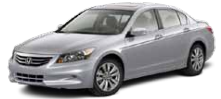
Accord SEDAN EX-L V6