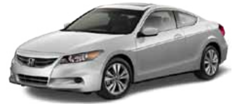
Accord COUPE EX-L WITH NAVI