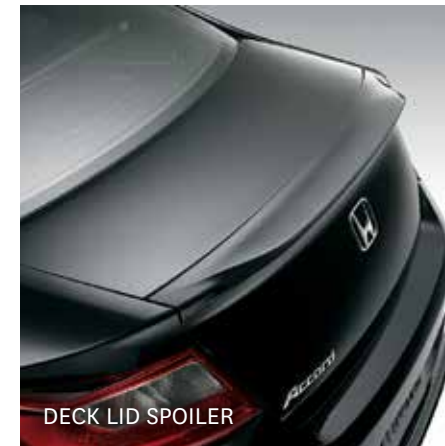
DECK LID SPOILER