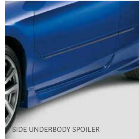
SIDE UNDERBODY SPOILER