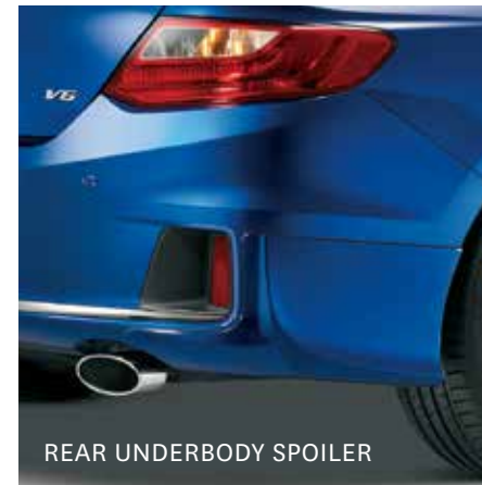
REAR UNDERBODY SPOILER