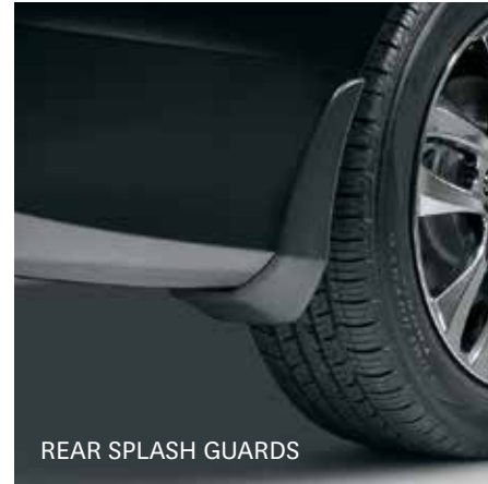
REAR SPLASH GUARDS