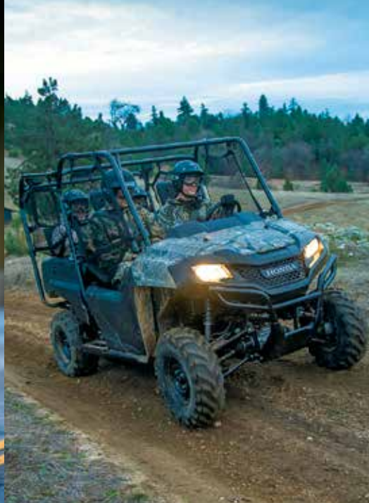
SIDE BY SIDE