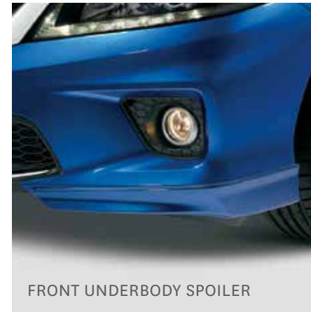
FRONT UNDERBODY SPOILER