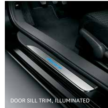
DOOR SILL TRIM, ILLUMINATED