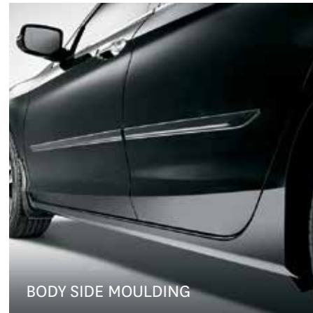
BODY SIDE MOULDING