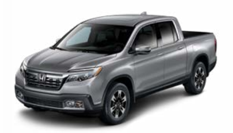
Lunar Silver Metallic